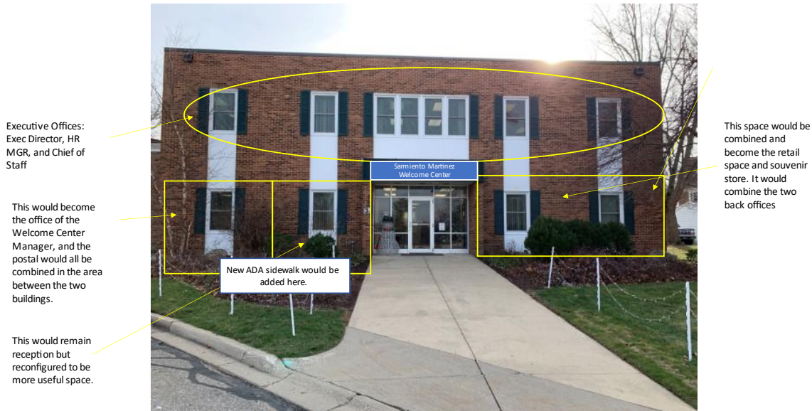
Current Admin Configuration

Checks can be made payable/sent to: VFW National Home 3573 S Waverly Rd. Eaton Rapids, MI 48827