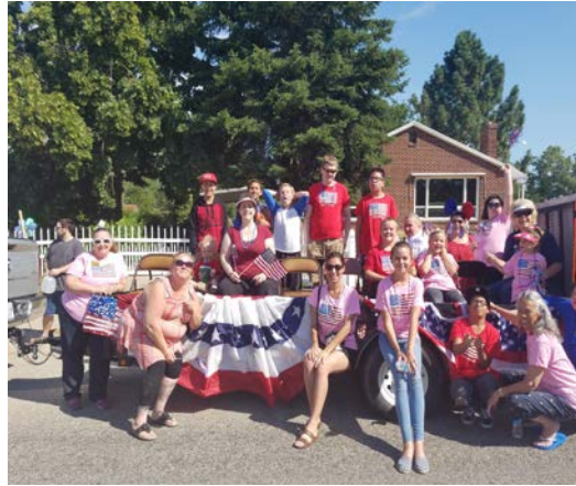
4 th of July Parade with Youth, VFW and Auxiliary

She went with several of the children from the youth group and handed out Certificates and said the Pledge of Allegiance to those that fly their flags.